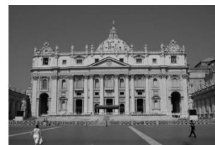
Basilica of Saint Peter Vatican City Rome

Round Trip Airfare & Hotel Transfers 19 Meals Included with Special Welcome & Farewell Celebrations Baggage Handling & Portage at First Class Hotels.