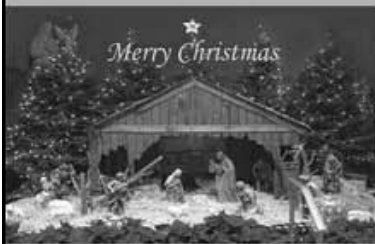
St. Thomas Manger (3) 5 1/2 (H) 8 1/2 (W)