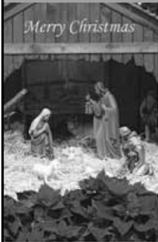
St. Thomas Manger (2) 8 1/2 (H) 5 1/2 (W)