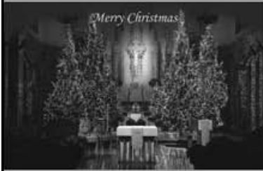
St. Thomas Altar (1) 5 1/2 (H) 8 1/2 (W)