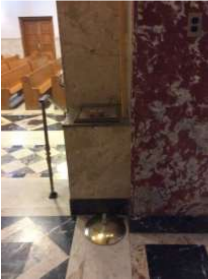
Cross Holder during Mass.

Place cross in holder and go to your seat.